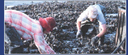
Around 3,200 people work in Washington's shellfish industry.

Source: Pacific Coast Shellfish Growers Association, 2008–2009